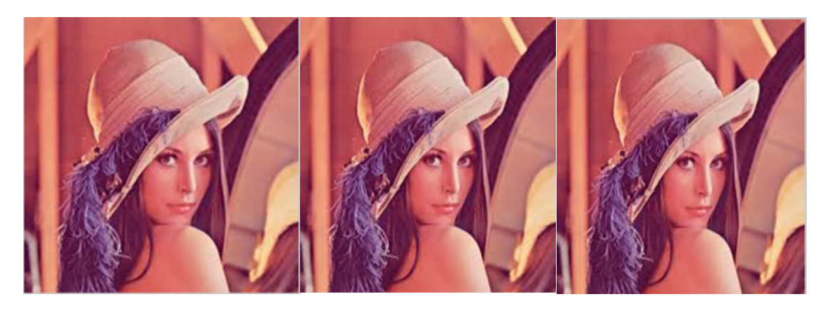
Figure 2: (a) Original Image 'Lena'; reconstructed image (8×8 block) using (b) BTC, (c) BTC-MM