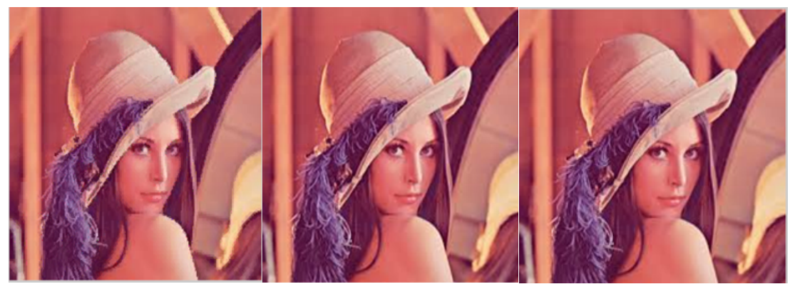
Figure 1: (a) Original Image 'Lena'; reconstructed image (4×4 block) using (b) BTC, (c) BTC-MM